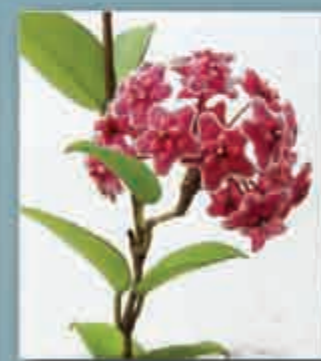
Order Ref 32013