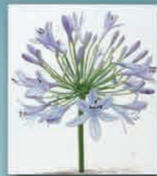
Order Ref 32001