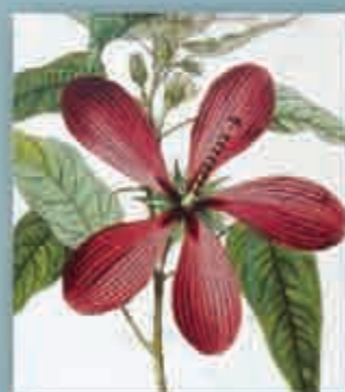
Order Ref 37363