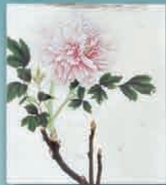
Order Ref 37395

Wooden wall plaques are sold in packs. Please refer to our price list for details. More designs and sizes are also available online including 20 x 22.5cm and 17.5 x 30cm.