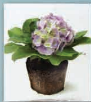
Order Ref 31034