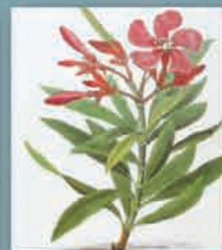
Order Ref 37241