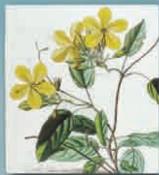
Order Ref 37366