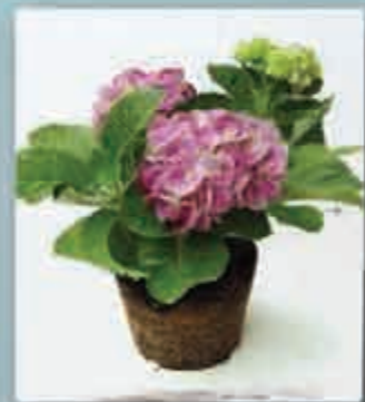
Order Ref 31033