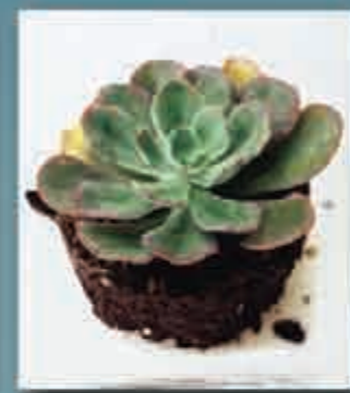
Order Ref 31004