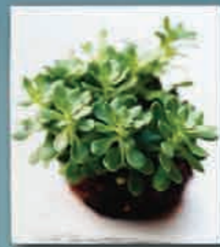
Order Ref 31003