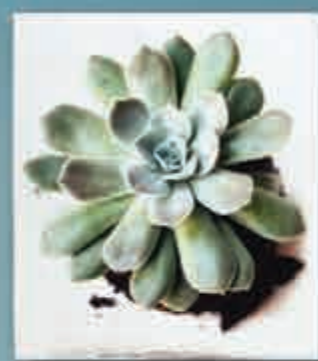
Order Ref 31002