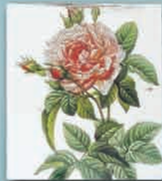
Order Ref 37376